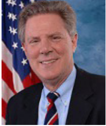
Rep. Frank Pallone (D-NJ-06) - $1,000