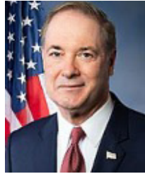
Rep. John Joyce, MD (R-PA-13) - $2,000