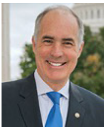
Senator Robert Casey (D-PA) - $2,500