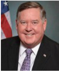
Rep. Ken Calvert (R-CA-42) - $1,000