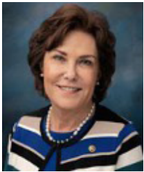
Sen. Jacky Rosen (D-NV) - $2,500