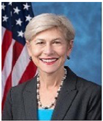
Rep. Deborah Ross (D-NC-02) - $1,000