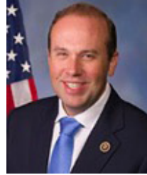
Rep. Jason Smith (R-MO-08) - $2,000