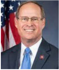
Rep. Greg Murphy, MD (R-NC-03) - $2,500