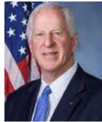
Rep. Mike Thompson (D-CA-04) - $1,000