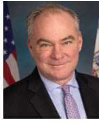
Senator Tim Kaine (D-VA) - $2,500