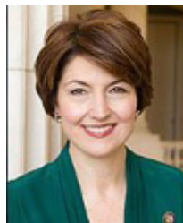
Rep. Cathy McMorris Rodgers (R-WA-05) - $2,500