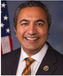
Rep. Ami Bera, MD (D-CA-06) - $5,000