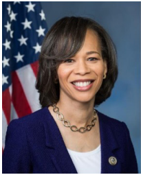
Rep. Lisa Blunt Rochester (D-DE-At Large) - $1,000