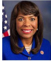
Rep. Terri Sewell (D-AL-07) - $1,000