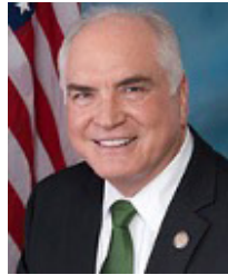
Rep. Mike Kelly (R-PA-16) - $1,000