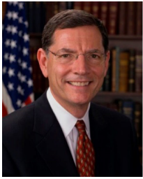
Sen. John Barrasso, MD (R-WY) - $1,000