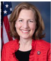
Rep. Kim Schrier, MD (D-WA-08) - $2,000