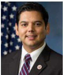
Rep. Raul Ruiz, MD (D-CA-25) - $2,500