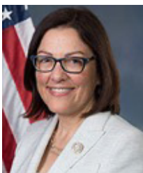
Rep. Suzan DelBene (D-WA-01) - $1,000