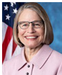
Rep. Mariannette Miller- Meeks, MD (R-IA-02) - $1,000