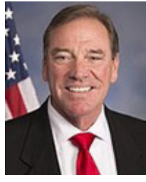
Rep. Neal Dunn, MD (R-FL-02) - $2,500